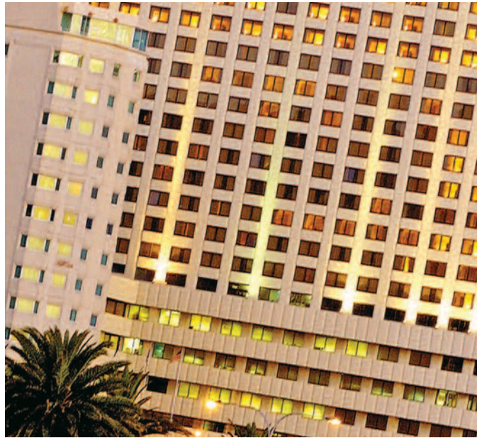
TABLE 1 PURCHASE PRICE

A specialist management rights financier will take you through a pre-qualification process that will give you a clear idea of your purchasing power, likely loan commitments and an indication of your income after debt servicing. There is simply no point in looking at a range of buildings until this